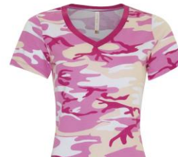
ATC™ EUROSPUN V-NECK LADIES' TEE ATC8001L