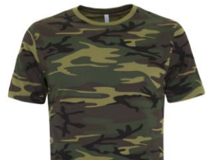
ATC™ EUROSPUN TEE ATC8000