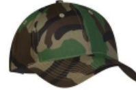
ATC™ MID PROFILE TWILL YOUTH CAP Y130