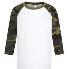
ATC™ ES ACTIVE BASEBALL YOUTH TEE ATC0822Y