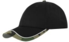
ATC™ CONTRAST TIPPED VISOR CAP C1304