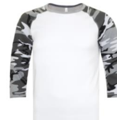
ATC™ ES ACTIVE BASEBALL TEE ATC0822