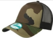
NEW ERA® SNAPBACK TRUCKER CAP NE205