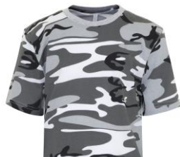
ATC™ EUROSPUN YOUTH TEE ATC8000Y