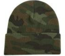
ATC™ KNIT TOQUE C100