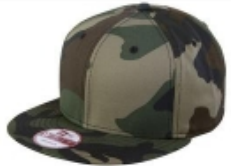
NEW ERA® FLAT BILL SNAPBACK CAP NE400