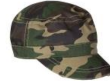
ATC™ DISTRESSED MILITARY CAP C180