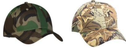
ATC™ MID PROFILE TWILL CAP C130